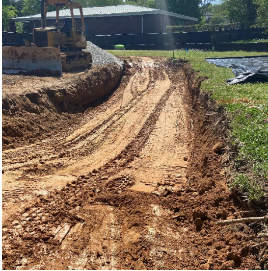
Building Pad Undercutting